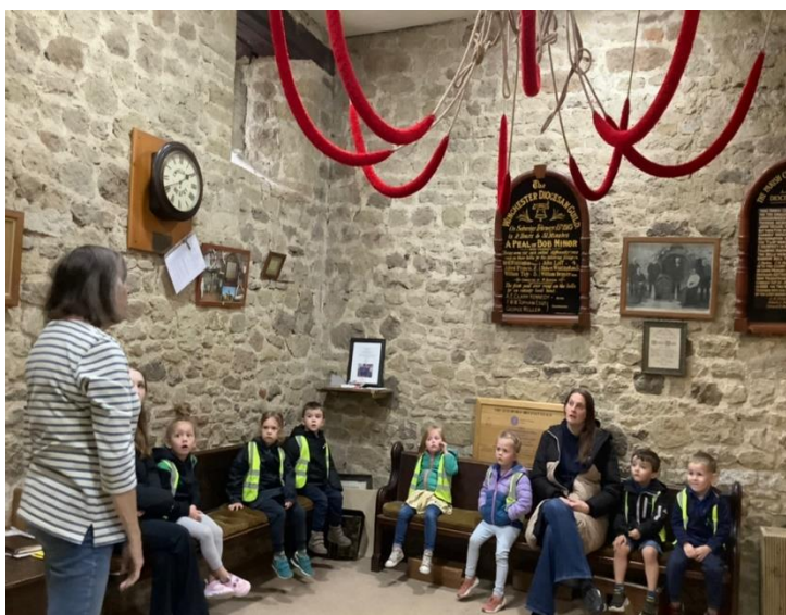
Thanks to FSPSP

Our Churches are committed to providing worship opportunities for families, and Christian teaching for children and young people. Our youth ministry has not yet fully regained momentum after the pandemic, although all-age services have recommenced at Okewood, and our Youth Team is exploring other initiatives.